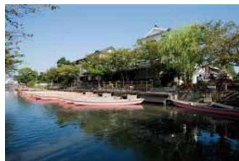
Shogetsu punting Station

You can book at “Shogetsu punting Station” ticket counter on the day, however private tours might be booked out.