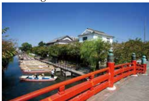
Shogetsu punting Station