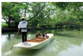
Western style punt

*From 7people, ¥ 1,600 per person is added to the minimum charge of ¥ 12,000(Donko).