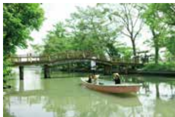
Japanese style punt

c/o Yanagawa Kanko Kaihatsu K.K. 329, Mitsuhashimachi Takahatake Yanagawa, Fukuoka 832-0826, Japan Tel: +81 (944) 72 6177 Email:mail@yanagawakk.co.jp